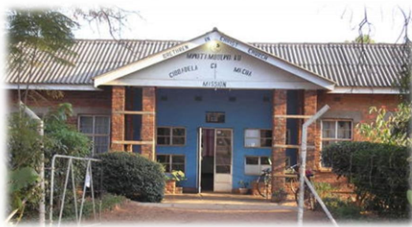
Figure 1 Macha Mission Hospital main entrance

At least 90% of the efforts of an ANBI have to be focused on the general good. If in a calendar year the sum of someone's gifts to ANBIs exceeds 1% of the Dutch threshold income, the excess, with a maximum of 10% of that income, is deductible income. In order to maintain this ANBI-status, it is of crucial importance to provide the necessary information throughout this annual report