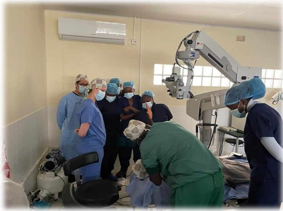
Figure 12 Cataract surgery observed by students

All surgeries took place at Macha Mission Hospital. The Eye for Zambia team did not perform procedures at other clinics. Most surgeries were done by the cataract surgeon and visiting ophthalmologists.