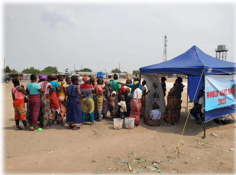
Figure 13 Screening patients during World sight day 2023