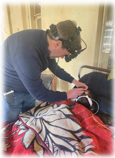
Figure 4. Eye examination of patient

In January 2017, Eye for Zambia started their activities in Macha Mission Hospital. After training the local staff, setting up protocols, establishing an optic shop and so much more, the clinic was transferred the local management in 2020. For more details, see paragraph 3.1.