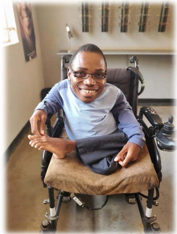
Figure 7 Patient received new glasses in order to help with photophobia complaints