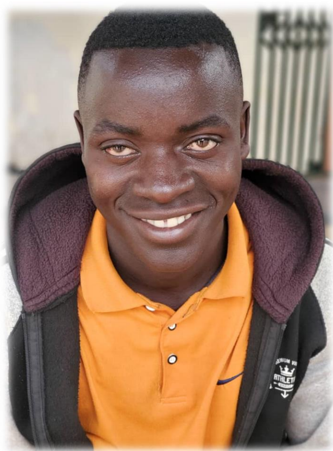
Figure 9 Happy 20 year old patient who was helped with cataract surgery which enabled him to get his eye sight back