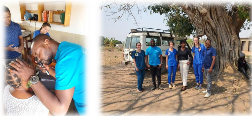
Figure 3 Outreach eye screening

Improving sight for residents of Zambia has an important side effect. Besides the enormous impact on a patient's quality of life, research shows that every euro invested generates 4 euros in economic profit. That is mainly because a whole cycle of poverty is broken. Children are no longer need to take care of their blind parents so that they can work again and their children can go back to school. This has an enormous positive effect on the economy of Zambia.