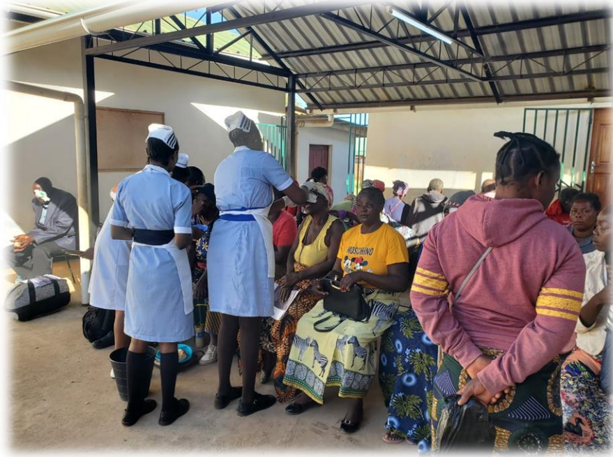
Figure 5 Nurses in training removing eye patches from operated patients