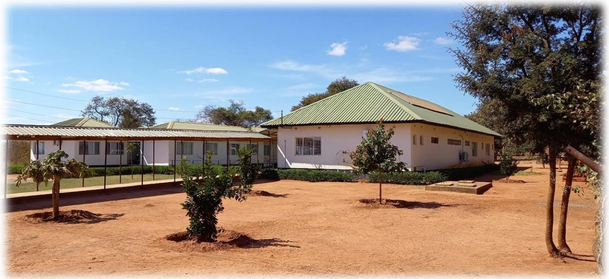
Figure 2 The Eye Clinic